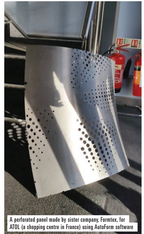
A perforated panel made by sister company, Formtex, for ATOL (a shopping centre in France) using AutoForm software

"2017 has been a great year for us and our turnover has substantially increased. In fact, the last four years have been very busy for us. The