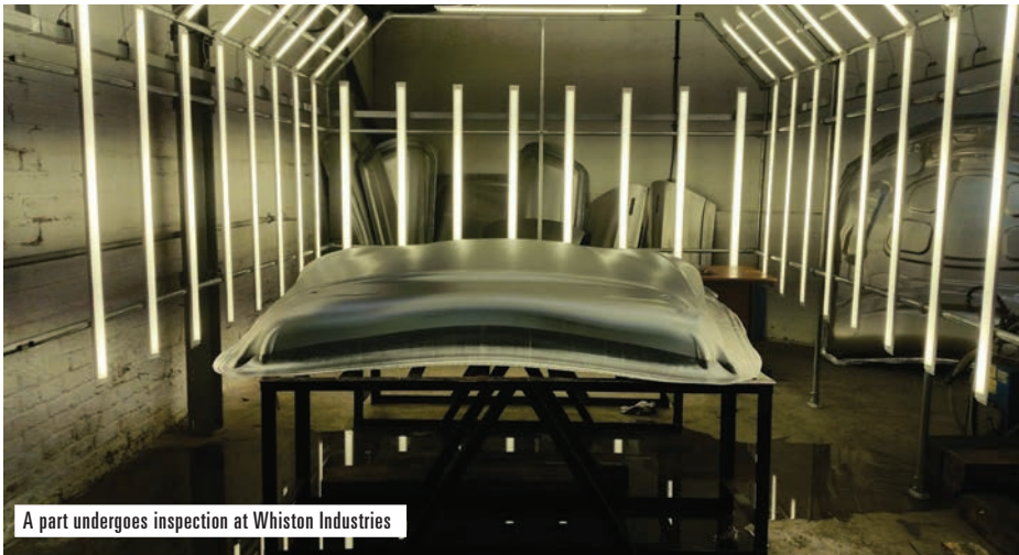
A part undergoes inspection at Whiston Industries

Simulation can also help to solve or engineer out cosmetic defect and skin surface quality issues. Standards are becoming stricter on this and a tool cannot be sold if a panel has a ripple in it. This can drive quite significant changes in forming techniques. Cosmetic issues are also, as Hackett pointed out, almost impossible to fix once the part has been stamped. It therefore uses AutoForm software to predict defects and correct them at the engineering stage.