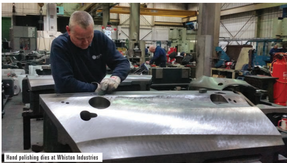
Hand polishing dies at Whiston Industries

“We are one of the few toolmakers left in the UK who can make very large dies.”