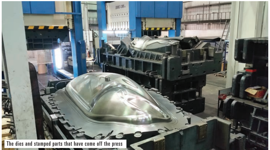
The dies and stamped parts that have come off the press

“Simulation can also help to solve or engineer out cosmetic defect and skin surface quality issues.”